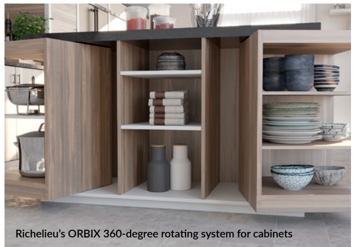
Richelieu's ORBIX 360-degree rotating system for cabinets