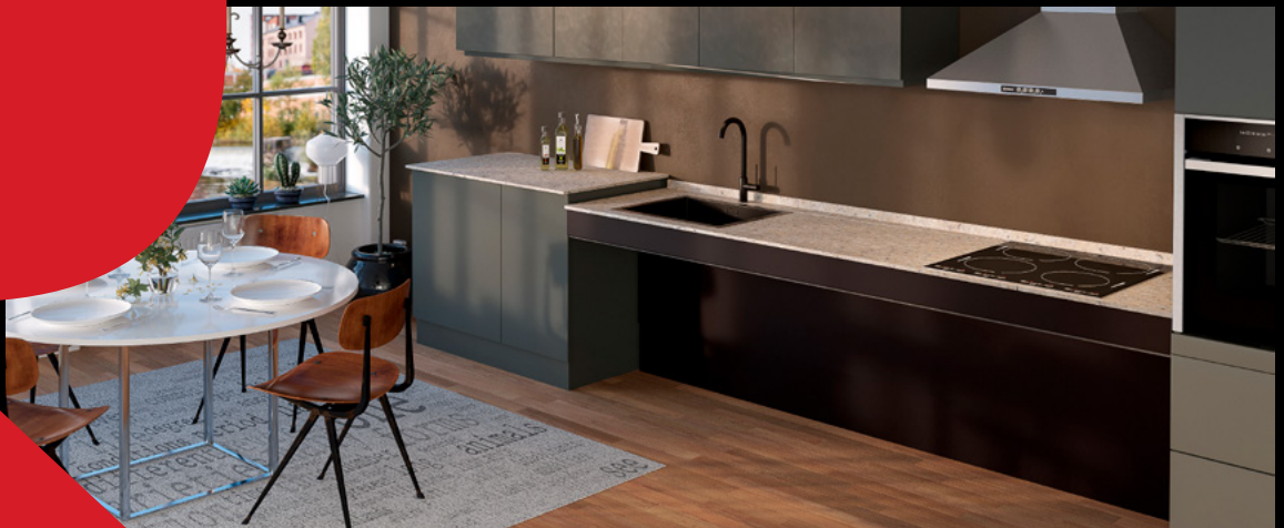
Richelieu's Baselift 6600 height-adjustable worktop system

Richelieu is proud to announce a new collaboration with Granberg, a renowned European manufacturer of accessible kitchen and living solutions. The partnership marks an exciting step forward in Richelieu's mission to bring inclusive, design-driven innovation to the North American market. Products such as the Butler 730 pushbutton wardrobe lift, the Baselift 6600 height-adjustable worktop system, and the Verti 840 motorized lift for upper cabinets exemplify this commitment to making modern kitchens more ergonomic, flexible, and universally accessible.