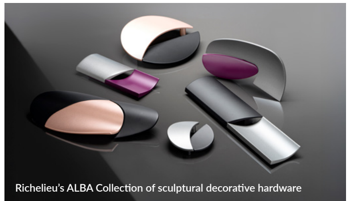
Richelieu's ALBA Collection of sculptural decorative hardware

Driven by innovation and design excellence, Richelieu's latest cabinet solutions combine advanced engineering with modern style. The high-quality, non-slip Grip Panel adds