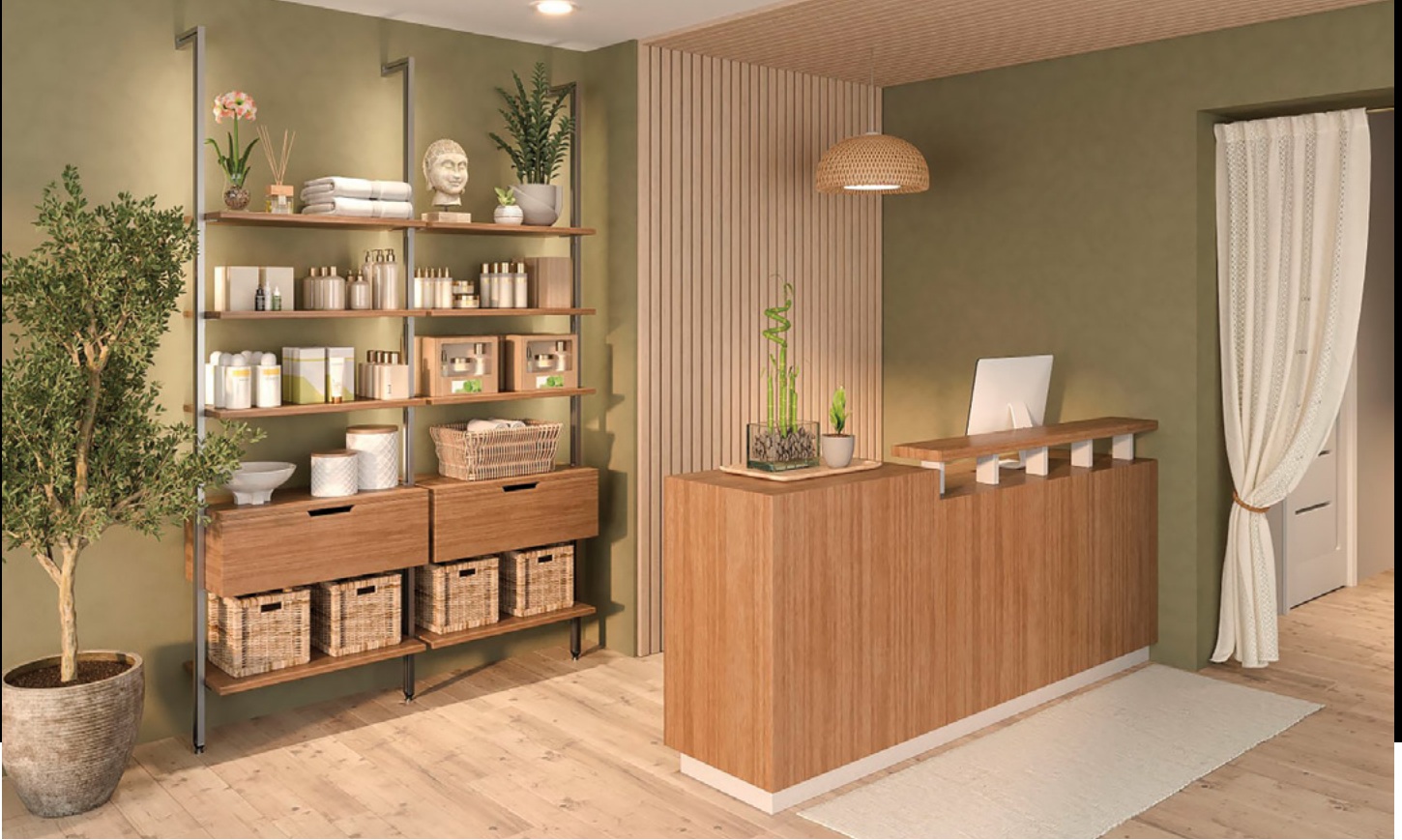
Above: Richelieu's LOGO III modular system offers floor-to-ceiling storage anywhere it's needed

concealed aluminum profiles that create the illusion of floating elements for sleek closets and living spaces. The LOGO III modular system can be customized to fit virtually any space with floor-to-ceiling or wall-mounted configurations that support rods, shelves, and drawer units. The YOUK open shelving system features six different configurations that can be combined as desired for the ultimate flexibility.