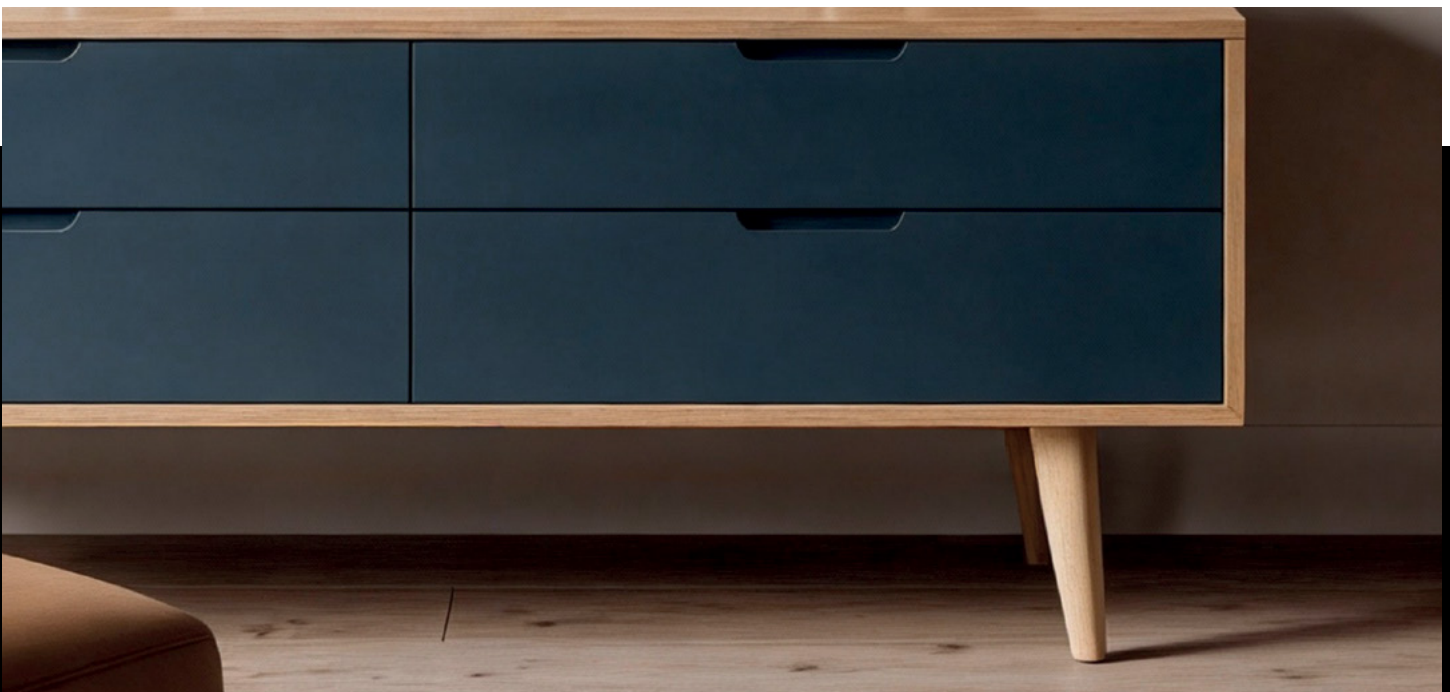
Richelieu's wooden furniture legs

Richelieu is expanding its decorative furniture offerings with a collection of designer furniture legs in an array of styles and materials including wood and metal. RIALTO furniture legs , designed to bring sculptural detail and refined sophistication to modern interiors. Defined by clean