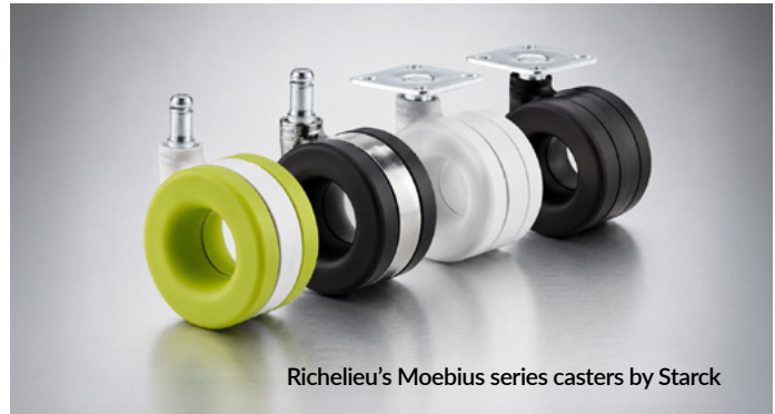
Richelieu's Moebius series casters by Starck

Richelieu offers a broad range of industrial casters designed to meet a variety of needs. The new Moebius series by Starck features perfectly aligned design lines for a look of continuity, not to mention ultra-smooth performance.