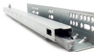
Richelieu's 828 Full-Extension Synchronized Concealed Undermount Slide

In today's cabinetry, exceptional function is just as important as a refined look. Richelieu's advanced drawer systems deliver smooth, effortless motion, long-lasting performance, and streamlined design details that enhance the comfort and experience of everyday living. Among the featured solutions is the Series 828 Full-Extension Synchronized Concealed Undermount Slide , engineered with synchronized soft-close technology for whisper-quiet operation and exceptional stability. The synchronized mechanism helps prevent drawer twisting and bending, ensuring a smooth, even glide regardless of where the drawer is pulled.