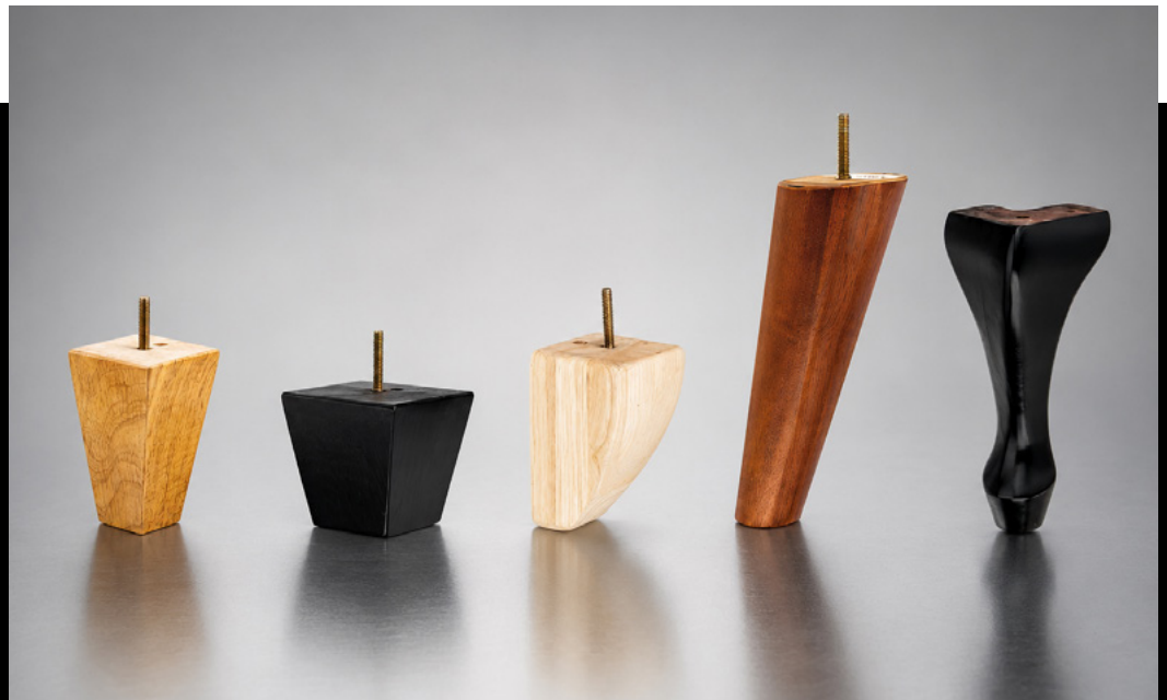
Wooden furniture legs from Richelieu

Richelieu's newest introductions are designed to blend refined aesthetics with expanded capabilities, elevating